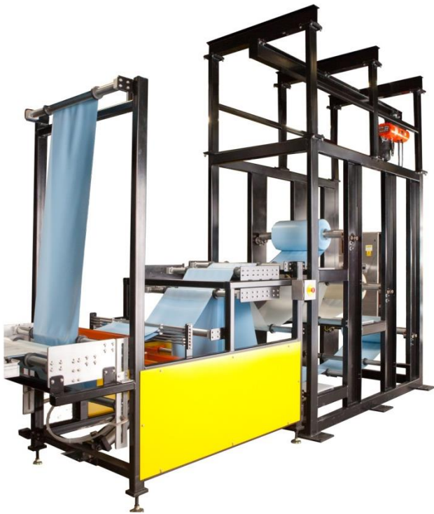
Three Roll Unwind Stand

Thermex Thermatron, LP , the premier builder of high power industrial systems for heating dielectric materials, introduces our customizable Multiple Roll Unwind Stands . These heavy duty stands can be used in conjunction with our RF and thermal heat sealing systems, and are controlled via the sealing system's PLC. Shown below are two of our stands – a three (3) roll and a four (4) roll. Our engineering team can customize an unwind stand to meet your manufacturing demands.